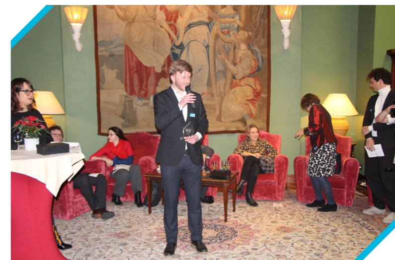
Dare To Learn receives the LLLAward for best «Active Citizenship» initiative