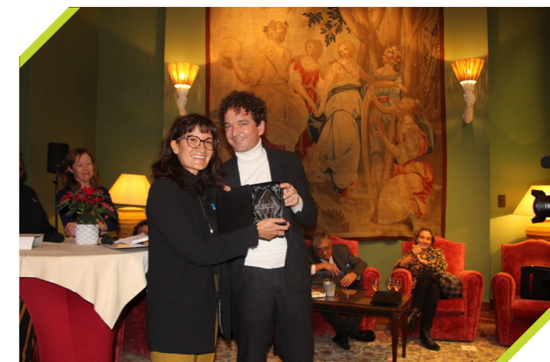
FOCSIV receives the LLLAward for best «Validation» initiative