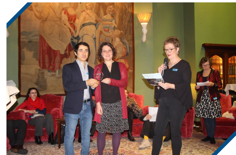
TOY receives the LLLAward for best «Learning environments» initiative